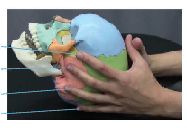
Fig. 13.1 Vault contact.

Mastoid portion of the temporal bone Lateral angle of the occiput